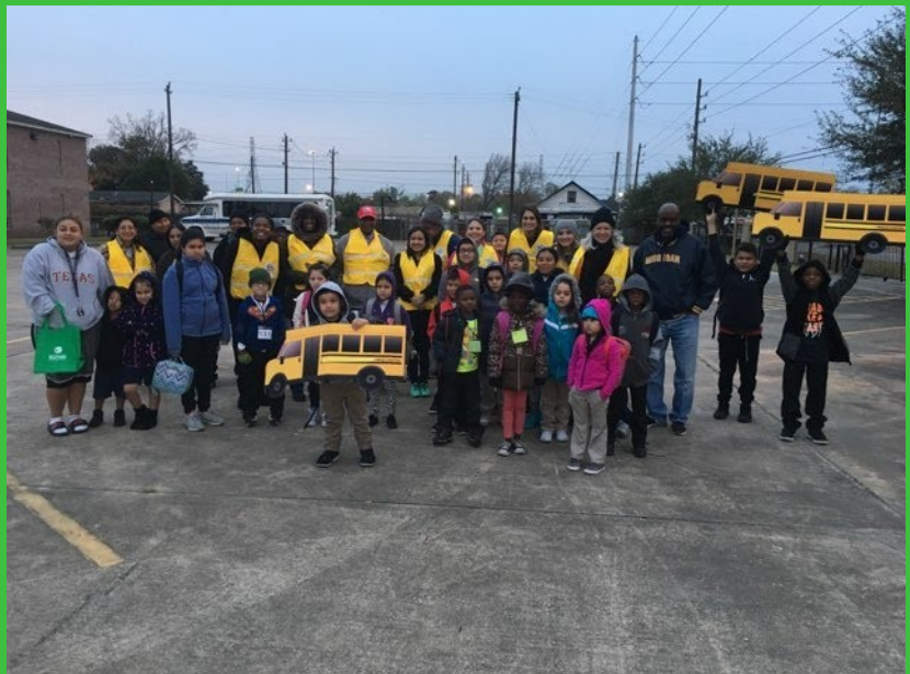
Roderick Paige Elementary students and parents enjoying Walk to School Day.

The event raised awareness about the need for safe routes for walking. It also emphasized the importance of physical activity among children, pedestrian safety, and concern for the environment. Walk to School Day events also help build connections between families, schools and the community.